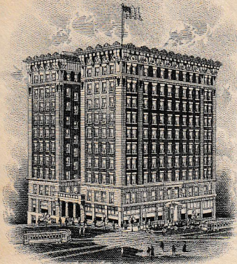
HOTEL FRYE SEATTLE